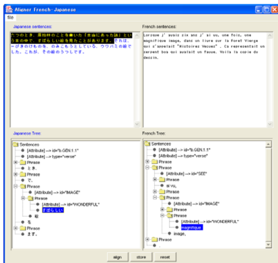
Fig.3 Examination example

We examined the first sentence of the first chapter in “The Little Prince”. Below are the French and Japanese sentences.