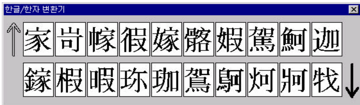
Figure 2: Chinese characters corresponding to a given Korean character

Figure 2 displays a sample subwindow for Chinese characters corresponding to a given Korean character to input a Chinese character.